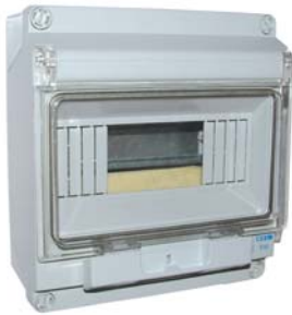
(up to 8 poles)