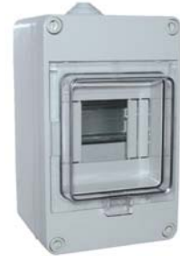
(up to 4 poles)