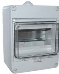
(up to 6 poles)