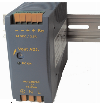
Din Rail Mount SWD