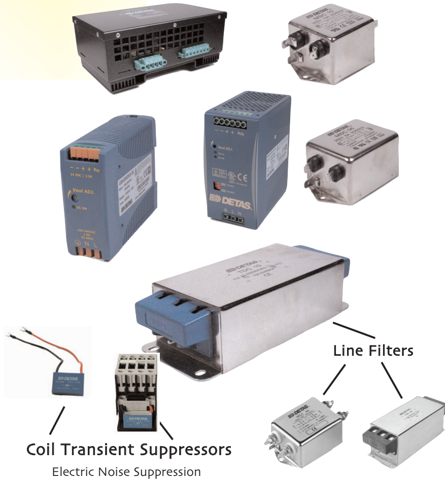
Coil Transient Suppressors Electric Noise Suppression